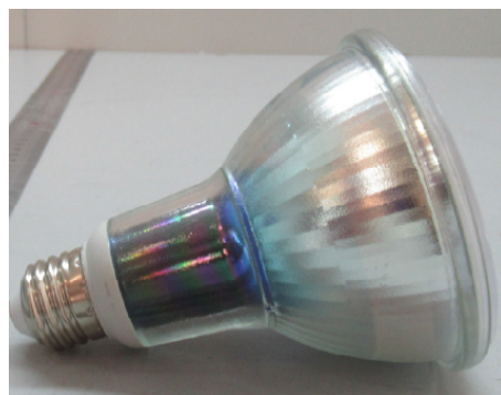
long lamp neck (9290022540, 9290022541, 9290022542, 9290022543, 9290022544, 9290022545)

Please contact me if there is need for any additional clarification or information.