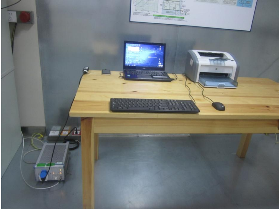
JBP radiation L