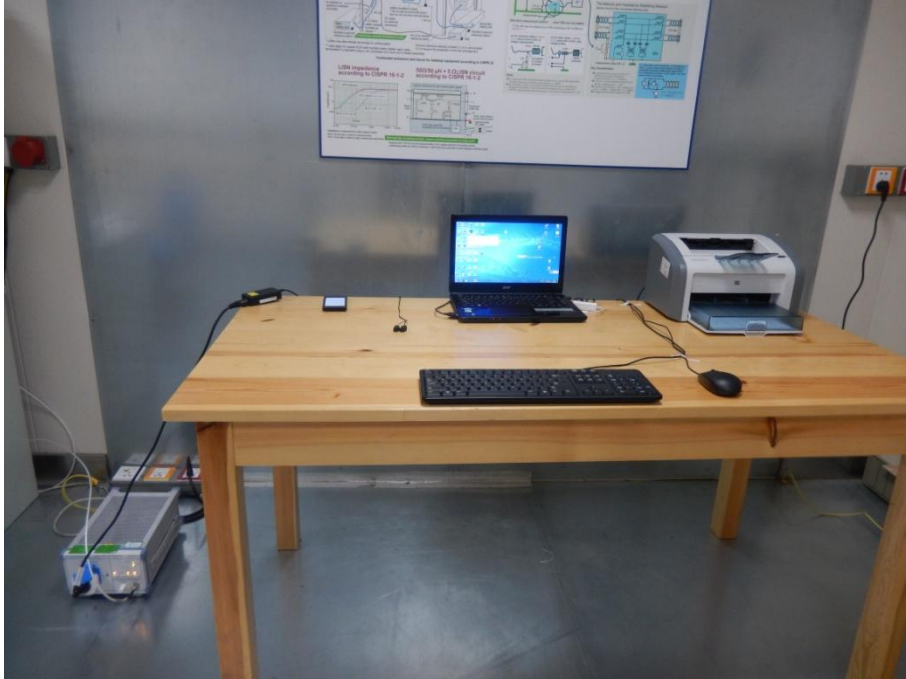
JBP radiation L