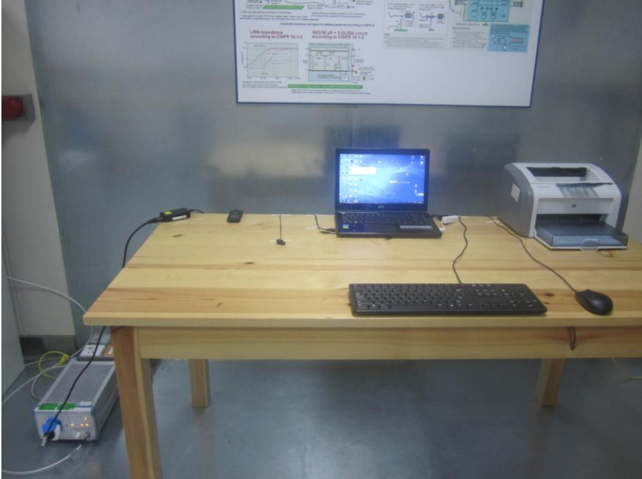
JBP radiation L