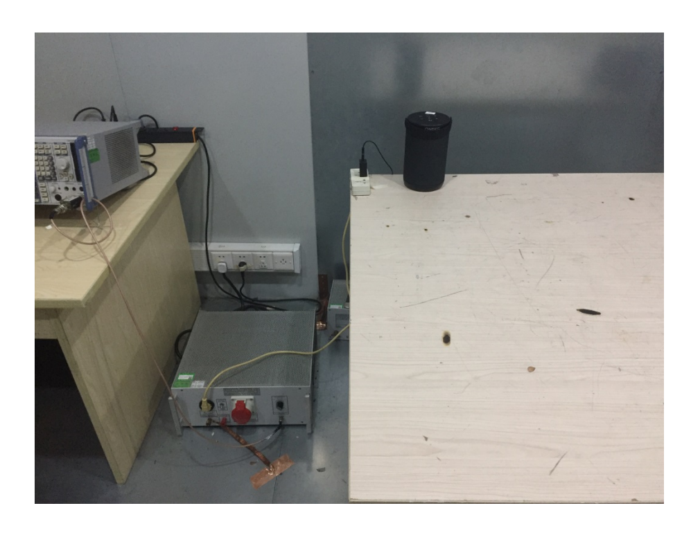
Power Adapter Model 2:NBS10B050200VUU