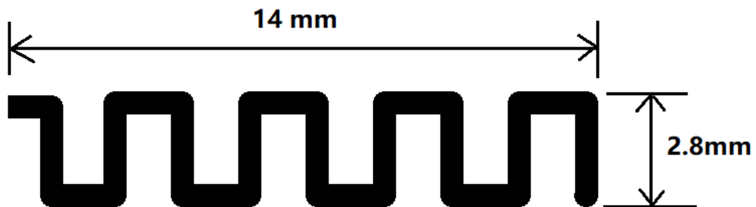
Antenna Photo & Length (mm)