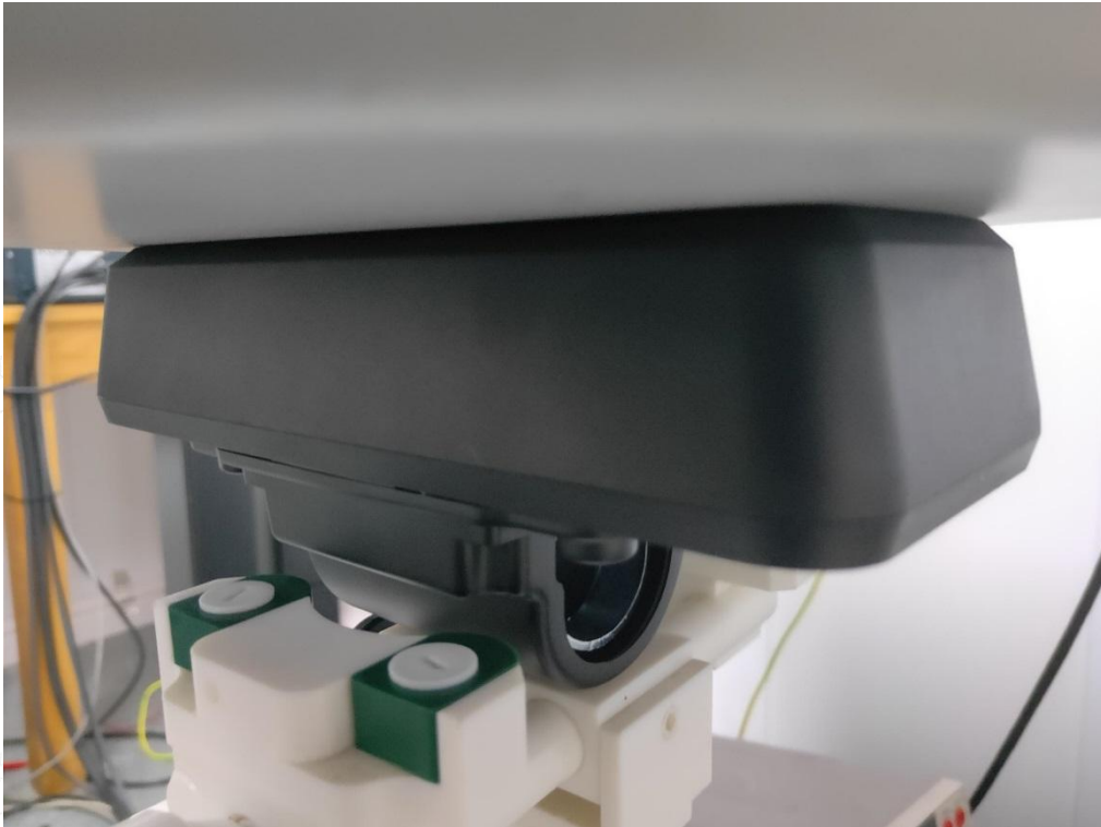
0mm body Vertical-Back Side Setup Photo