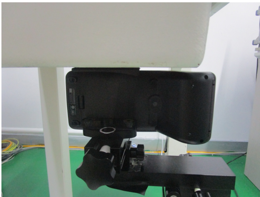
Handheld Bottom Setup Photo(0mm)