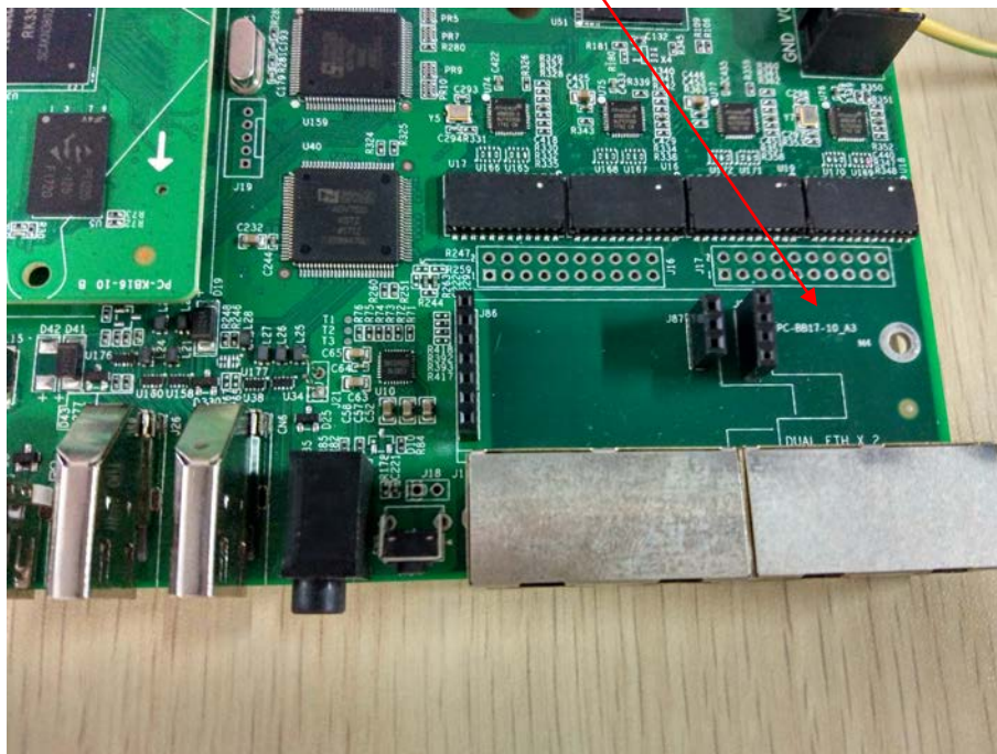
FCC ID Label Location