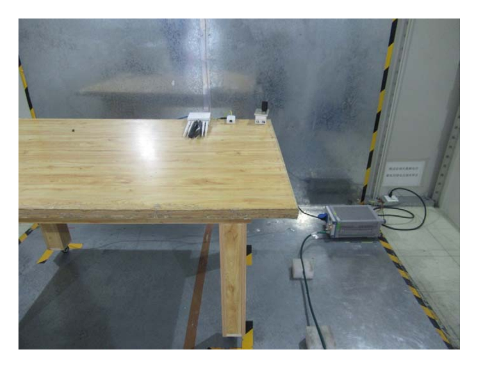
Conducted Emissions (Side View)