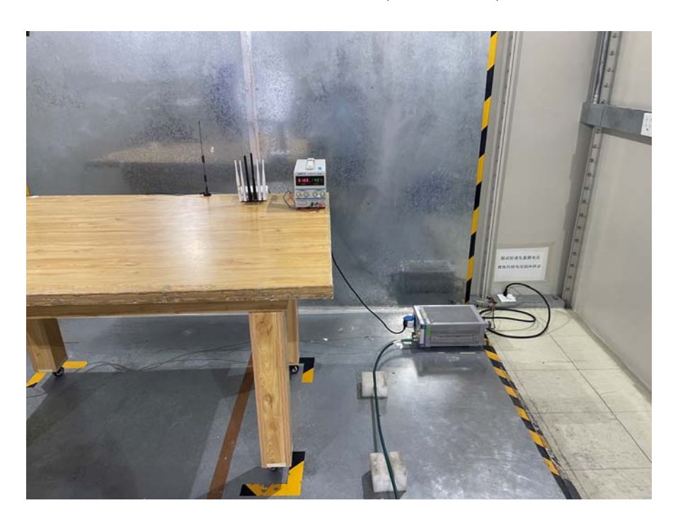
Conducted Emissions (Side View)