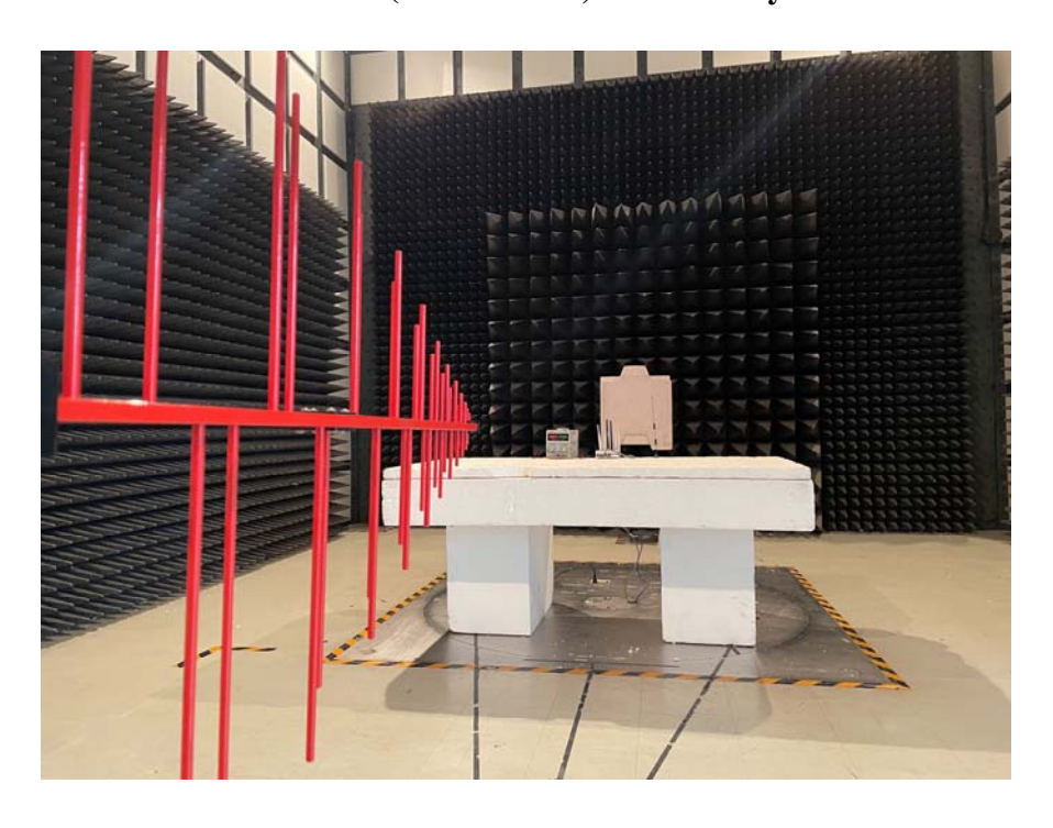
RadiatedEmissions (Below 1GHz)- Powered by POE