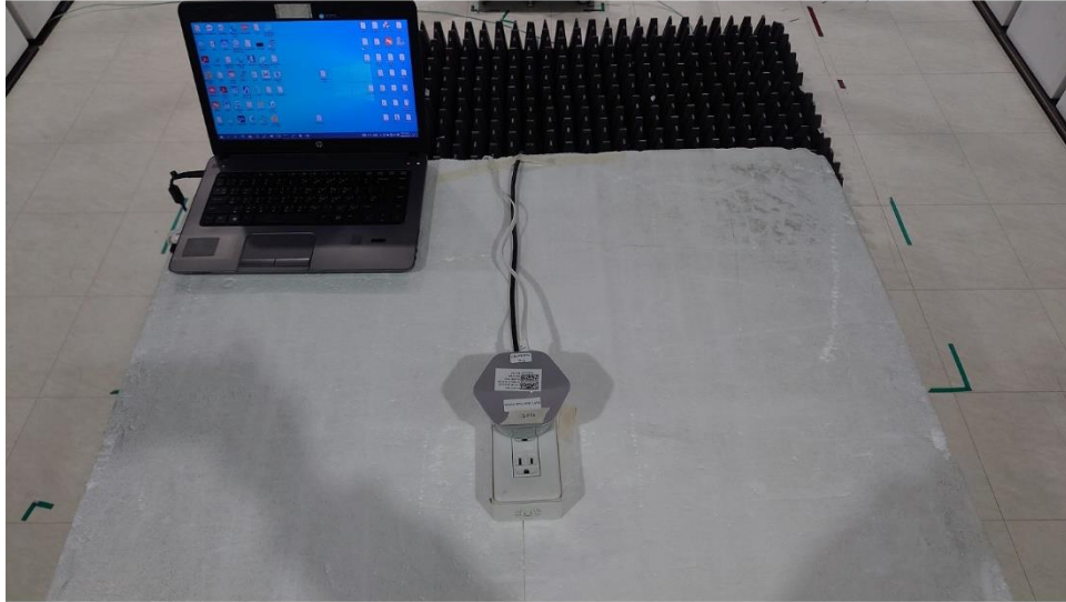
Above 1 GHz _ Rear View