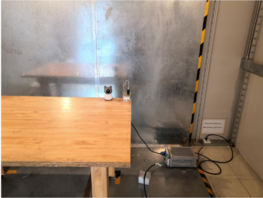
Conducted Emissions (Side View)