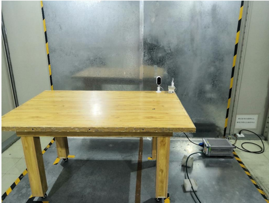
Conducted Emissions (Side View)