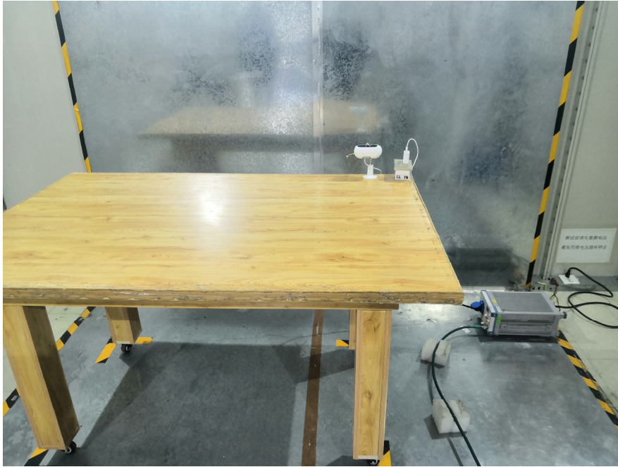
Conducted Emissions (Side View)