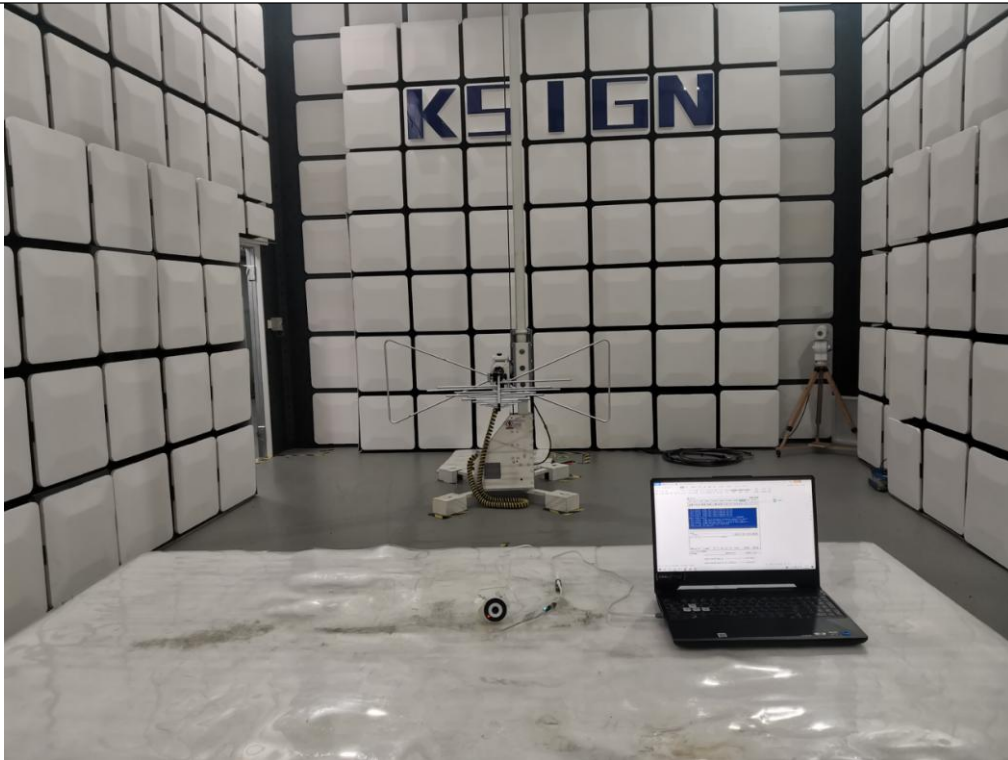
Radiated Measurement (Above 1GHz)