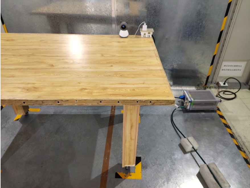
Conducted Emissions (Side View)