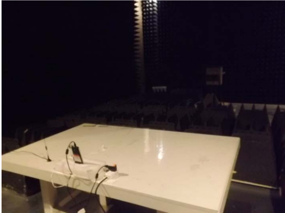
For Above 1GHz Test Site 1#