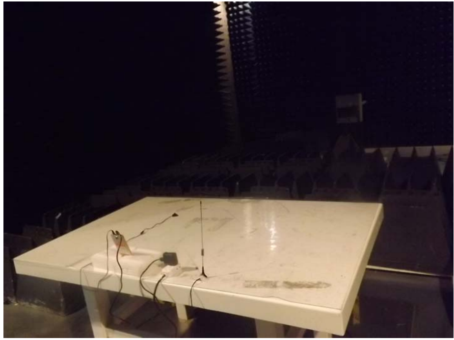
For Above 1GHz Test Site 1#