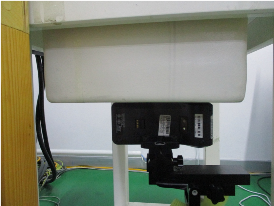
Bottom Setup Photo(0mm)