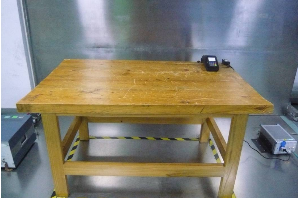
Conducted Emission-Side View(Adapter#1)