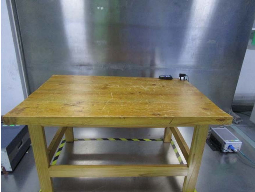
Conducted Emission-Side View(Adapter#2)