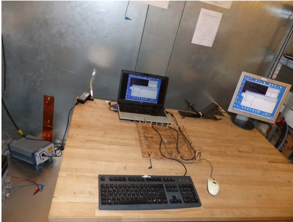
Photo 4: Test setup for radiated measurements (EUT supplied by primary AAA size 1.5 V cells, unintentional radiator §15.107, ANSI C63.4)