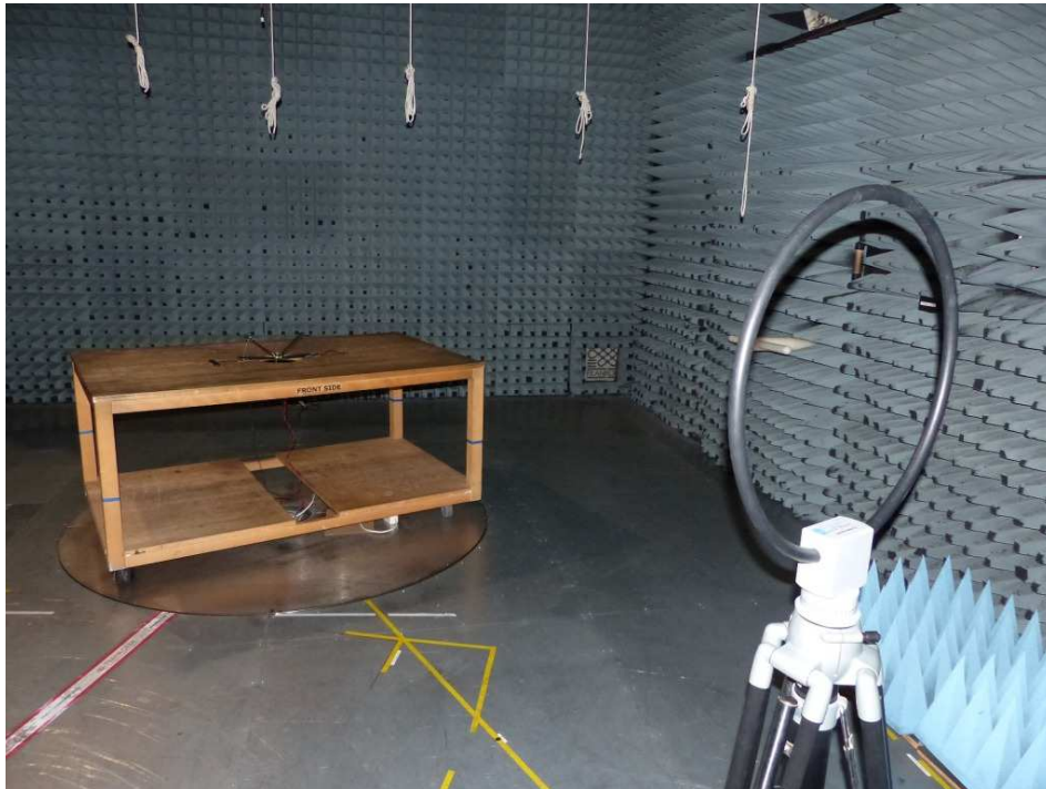
Photo 1: Test setup for radiated measurements (Enclosure, below 30 MHz, intentional radiator §15, ANSI C63.10)