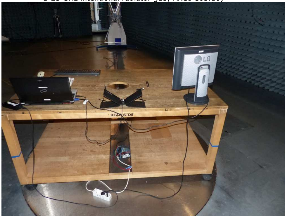
Photo 4: Test setup for radiated measurements (EUT supplied by primary AAA size 1.5 V cells, unintentional radiator §15.109, ANSI C63.4)