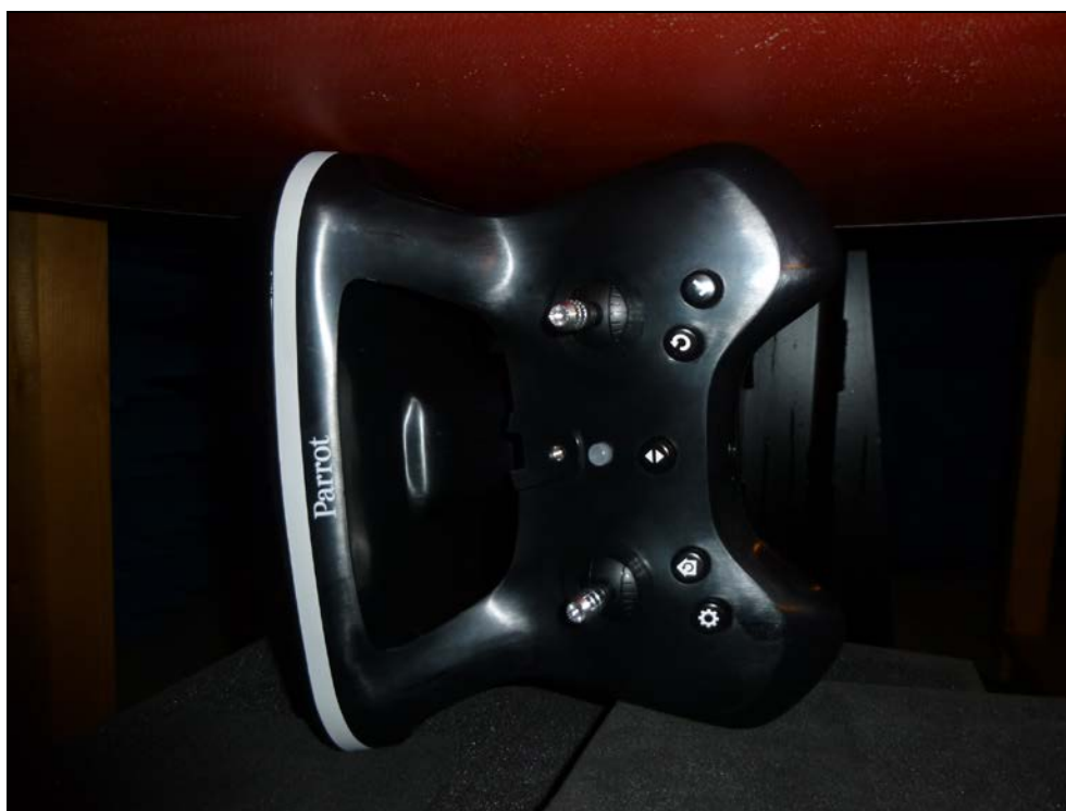
Fig. 5: Right side at 0cm from the phantom