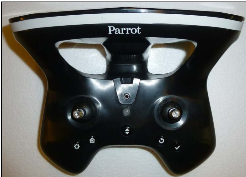
Up side for the testing