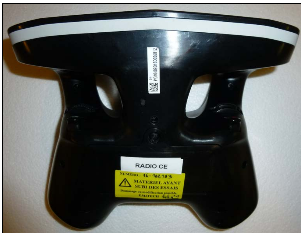
Down side for the testing