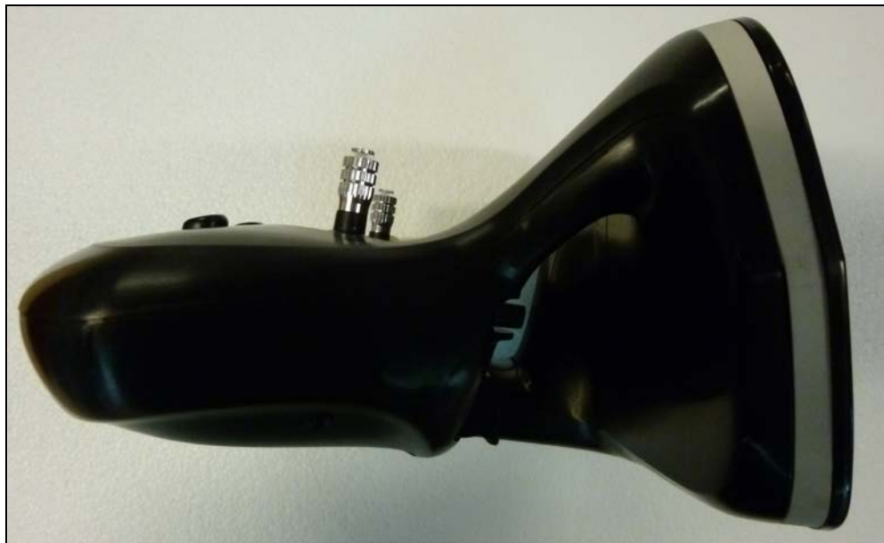
Right side for the testing