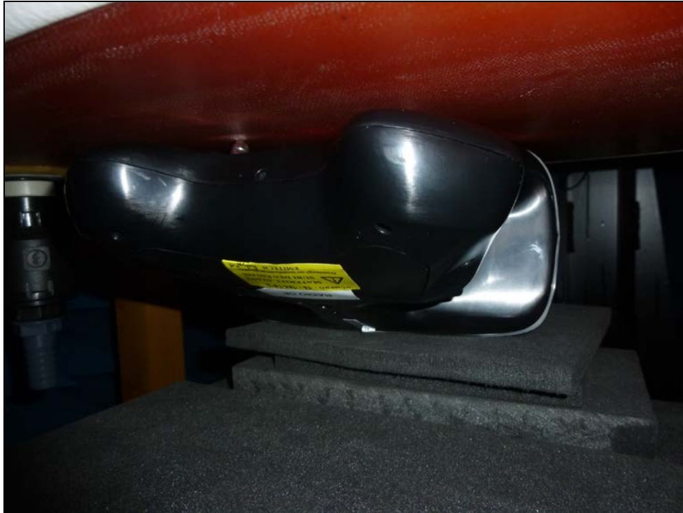
Fig. 6: Up side at 0cm from the phantom