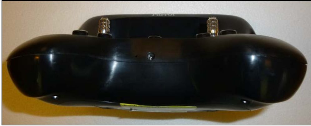
Rear side for the testing