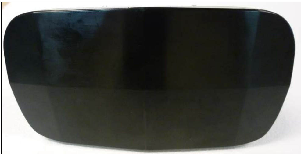
Front side for the testing