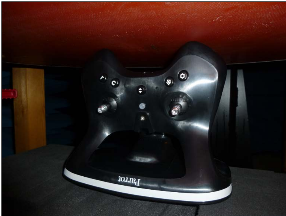
Fig. 3: Rear side at 0cm from the phantom