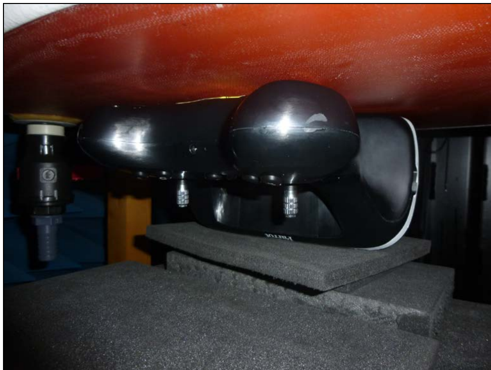
Fig. 7: Down side at 0cm from the phantom