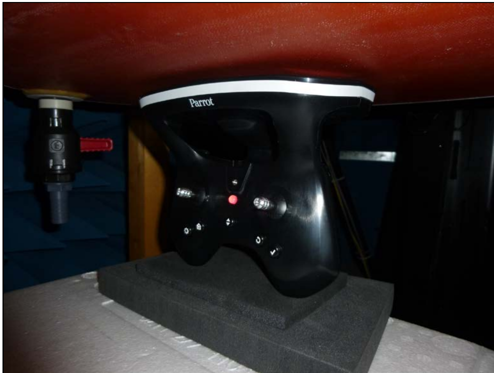
Fig. 2: Front side at 0cm from the phantom

The photographs of the equipment under test are shown in Fig. 2 to Fig. 9.