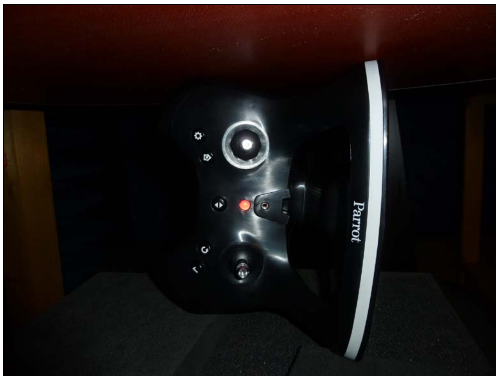
Fig. 4: Left side at 0cm from the phantom