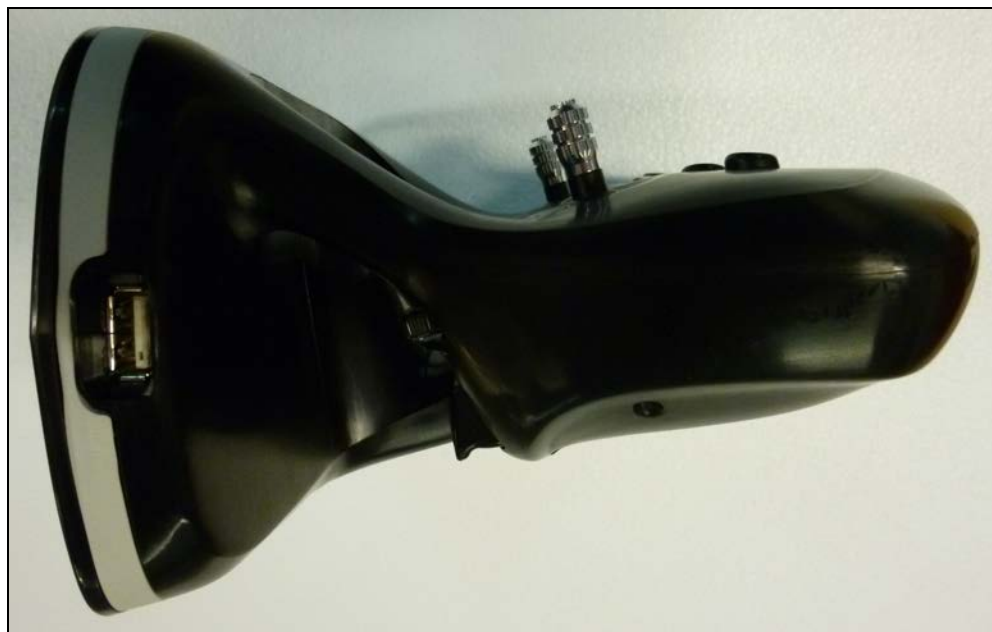
Left side for the testing