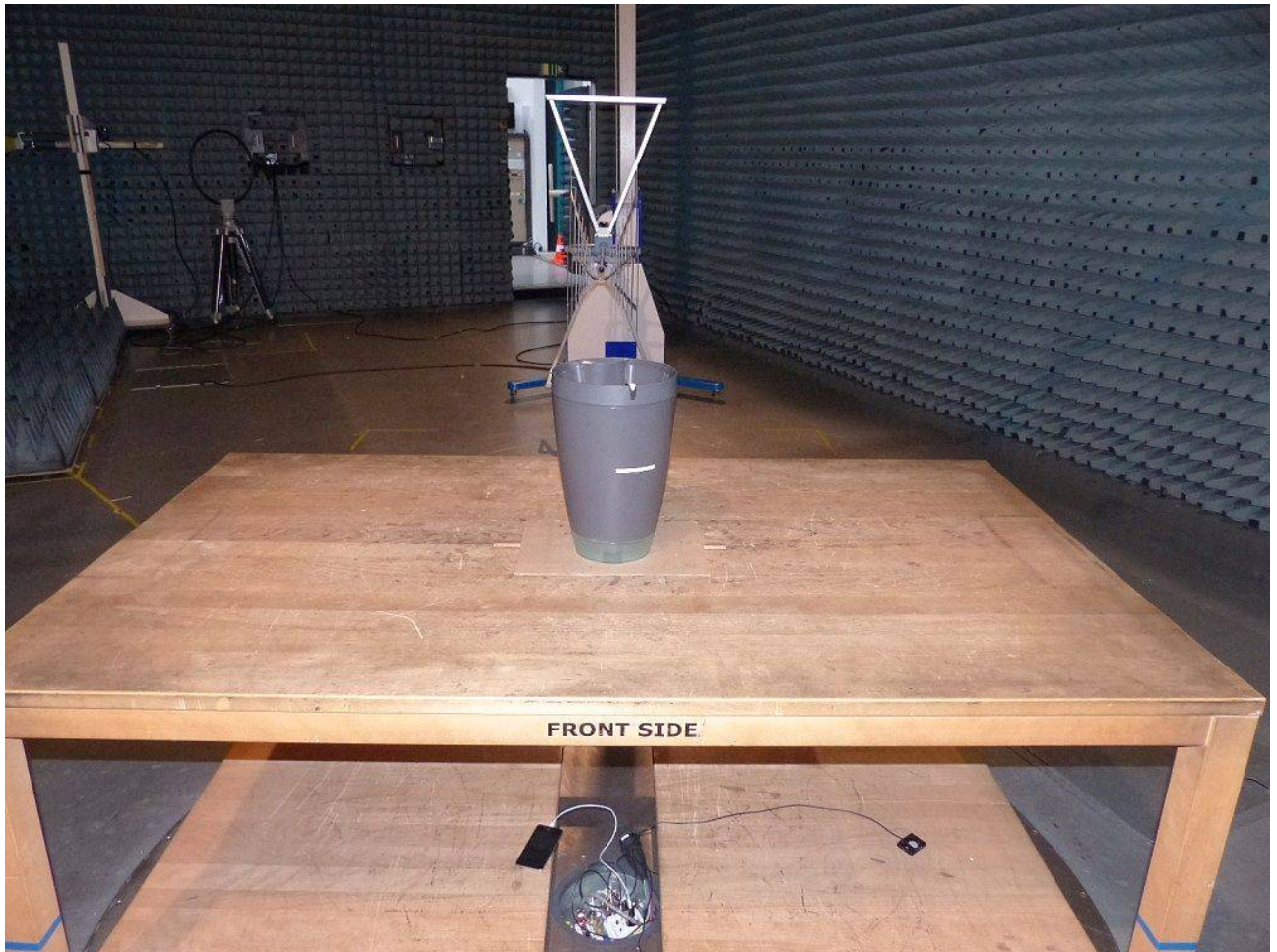
Photo 4: Test setup for radiated measurements (EUT supplied by primary AAA size 1.5 V cells, unintentional radiator §15.109, ANSI C63.4)