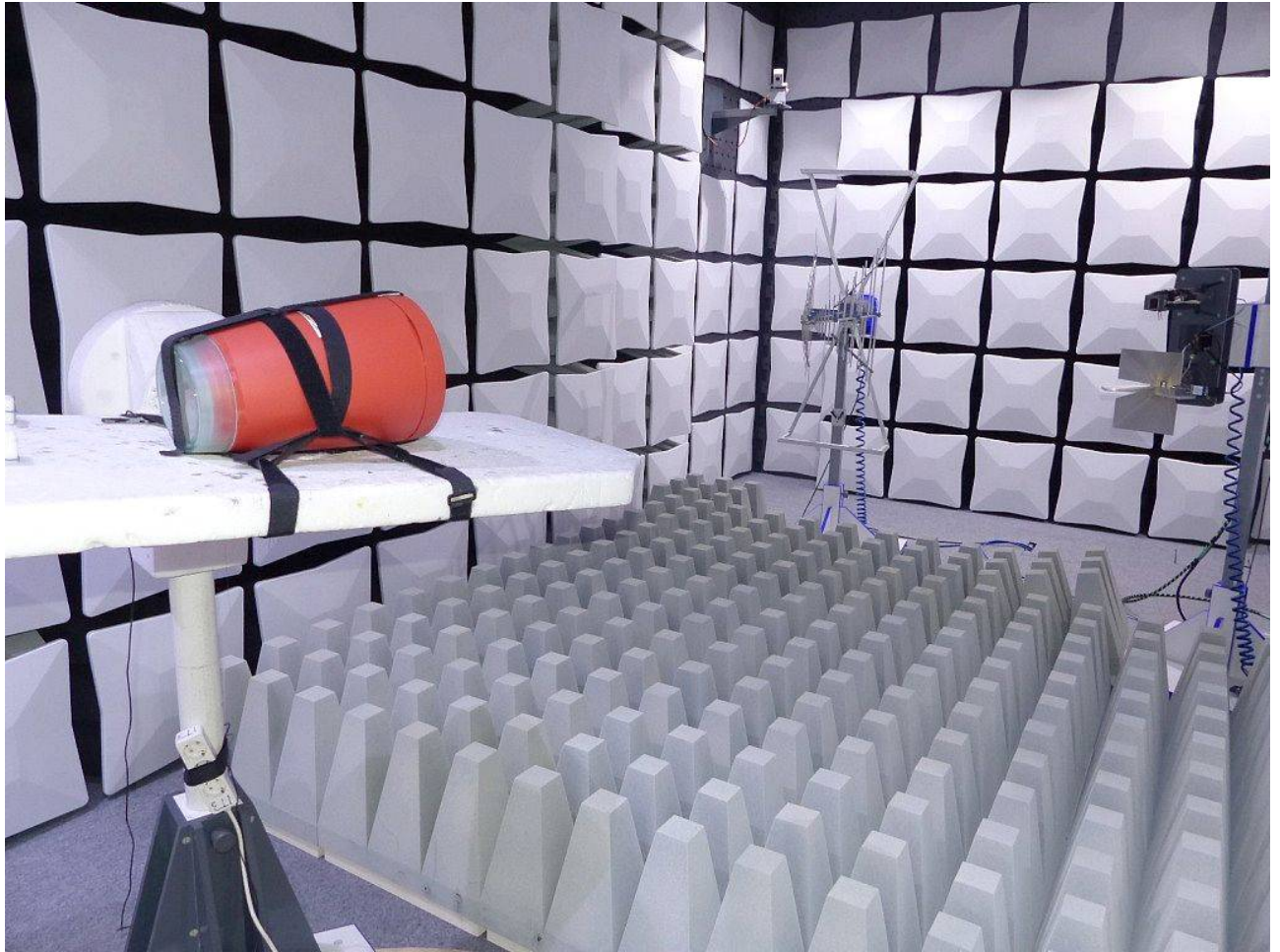
Photo 3: Test setup for radiated measurements (Enclosure, fully-anechoic chamber, 1-25 GHz intentional radiator §15, ANSI C63.10)