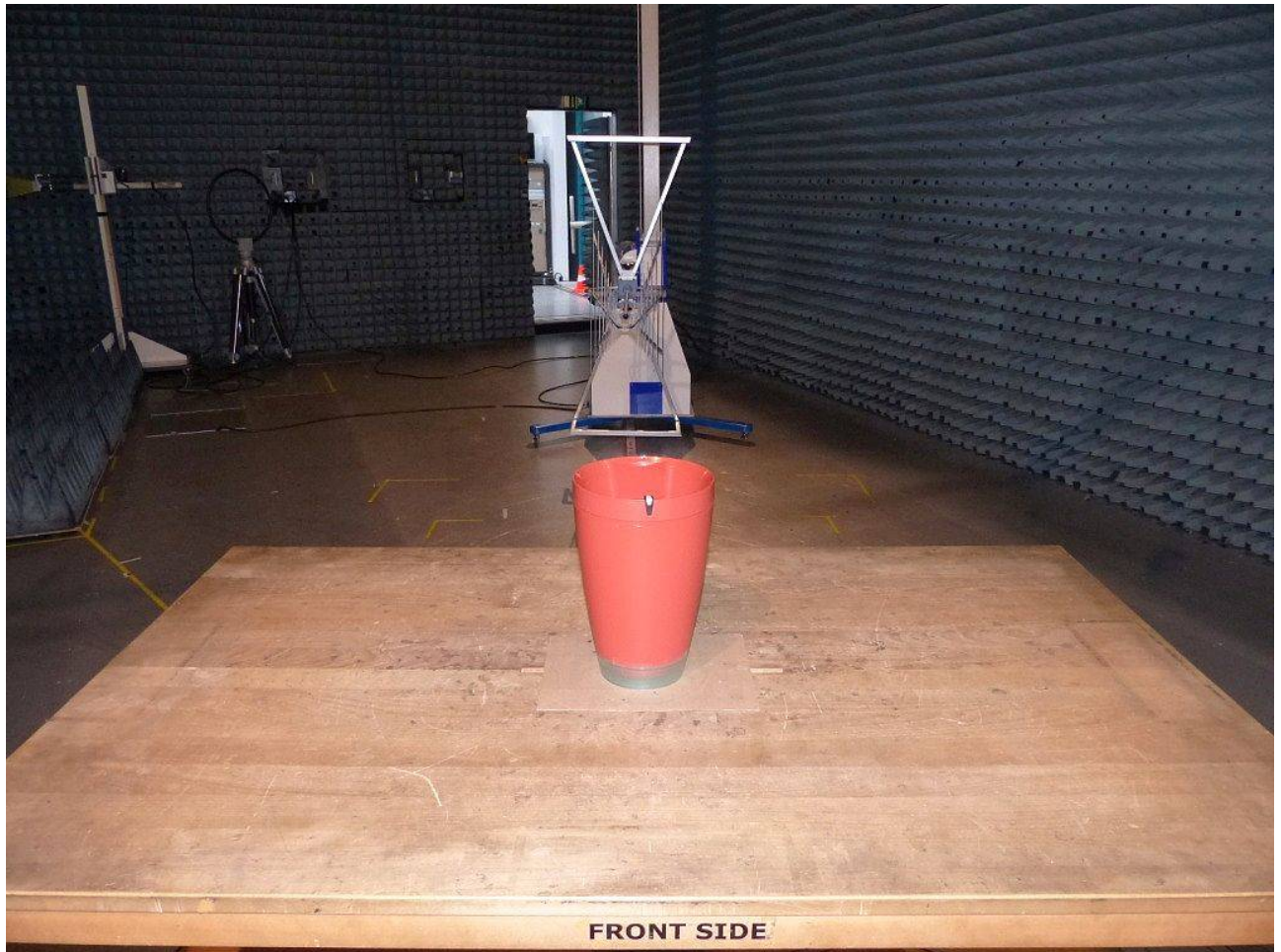
Photo 2: Test setup for radiated measurements (Enclosure, semi-anechoic chamber, 30 MHz to 1 GHz, intentional radiator §15, ANSI C63.10)