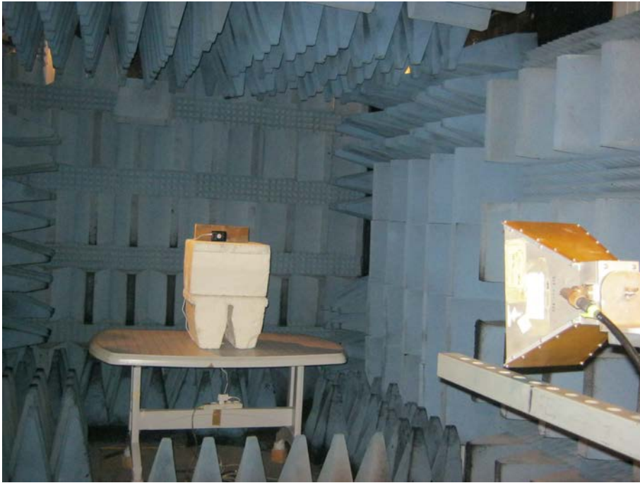
Figure 2. Intermodulated Radiated Emission Test