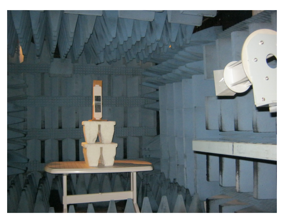
Radiated Emission Test, 18-26.5GHz