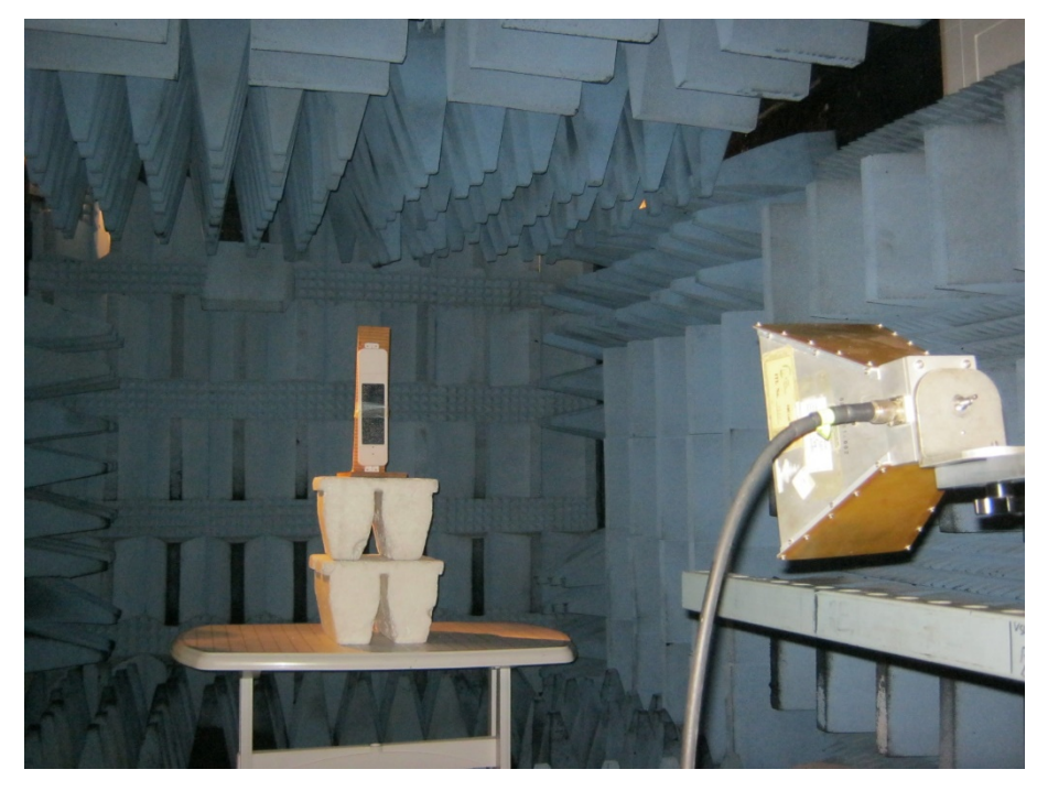
Radiated Emission Test, 1-18GHz and Intermodulation Radiated Emission Test