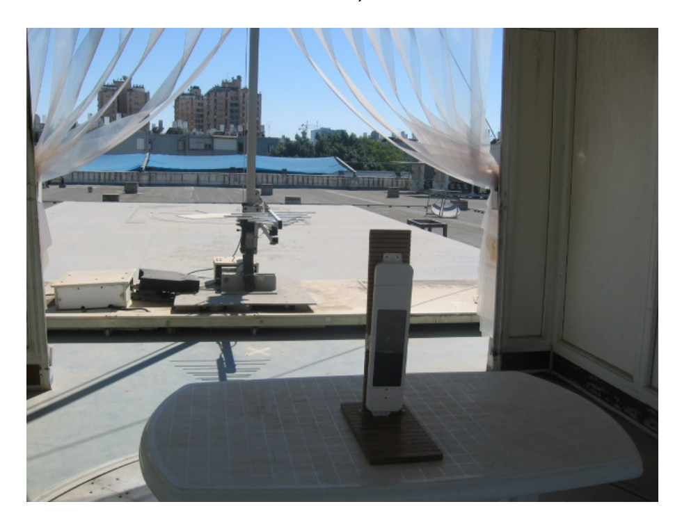
Radiated Emission Test, 200-1000MHz