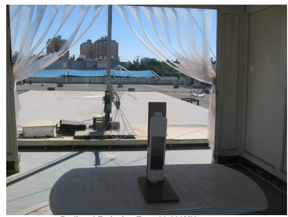
Radiated Emission Test, 30-200MHz