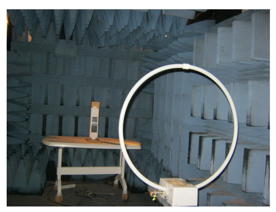
Radiated Emission Test, 0.009-30MHz