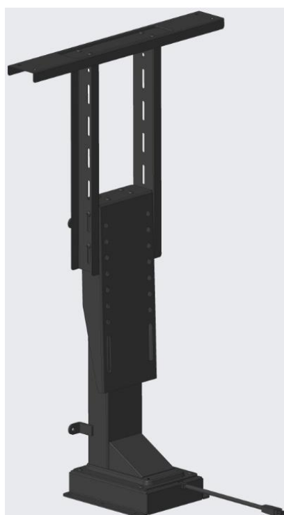
Figure 2 LP66-44M without TV MOUNT