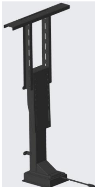
Figure 4 LP66-46M without TV MOUNT

LP66-44M is the same as LP66-46M except for size.