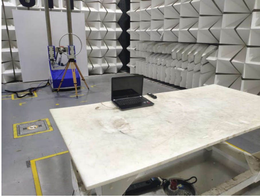
Radiated spurious emission Test Setup-1(Below 30MHz)