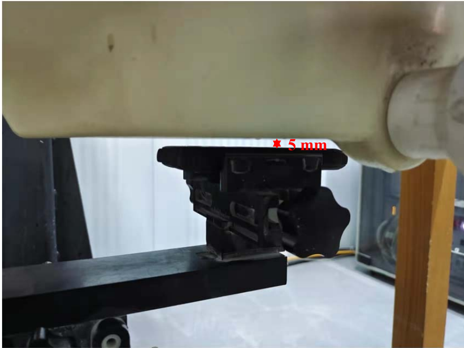
Body Top Setup Photo(5mm)