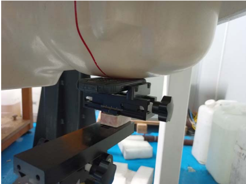
Head Left Tilt Setup Photo