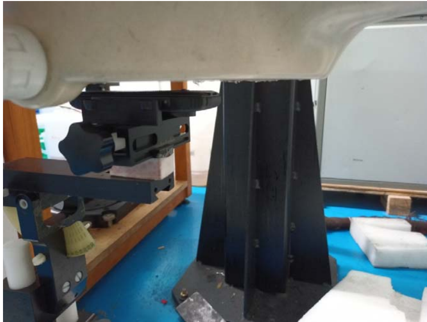
Body (Worn) Front Setup Photo (10mm)