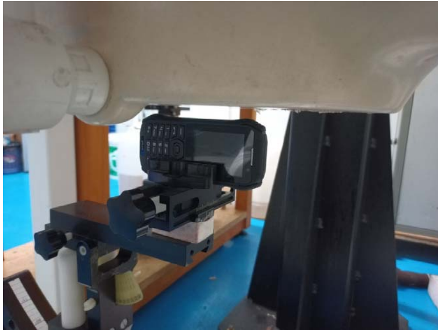
Body Right Setup Photo (10mm)