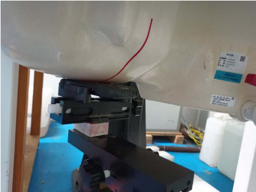
Head Right Tilt Setup Photo