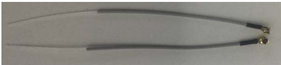
RF Antenna Assembly SPEC:2.4~2.5GHz

Dong guan Hengjie Electronic Technology Co., Ltd.