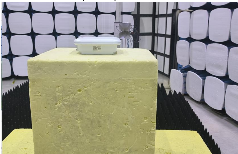
- End of the Appendix -

Unwanted Emissions that fall Outside of the Restricted Bands(Radiated) and Unwanted Emissions in the Restricted Bands (Radiated) above 1GHz