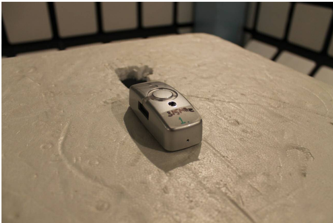
Photograph 3. EUT on table > 1GHz