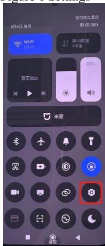
Figure 1 Settings