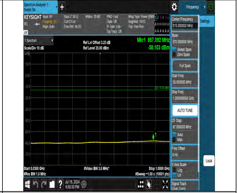
Band66 20MHz QPSK 132322 1RB#0 10000~20000 10000~20000