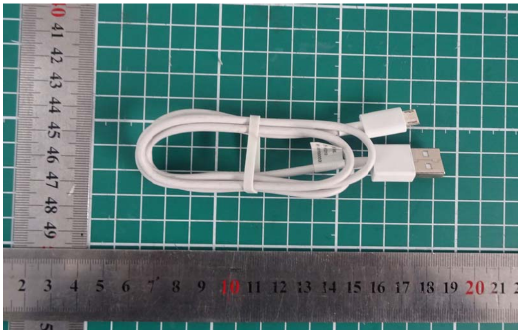
c: USB Cable