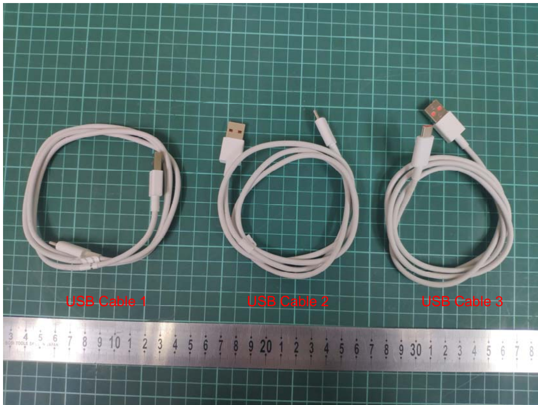
c: USB Cable