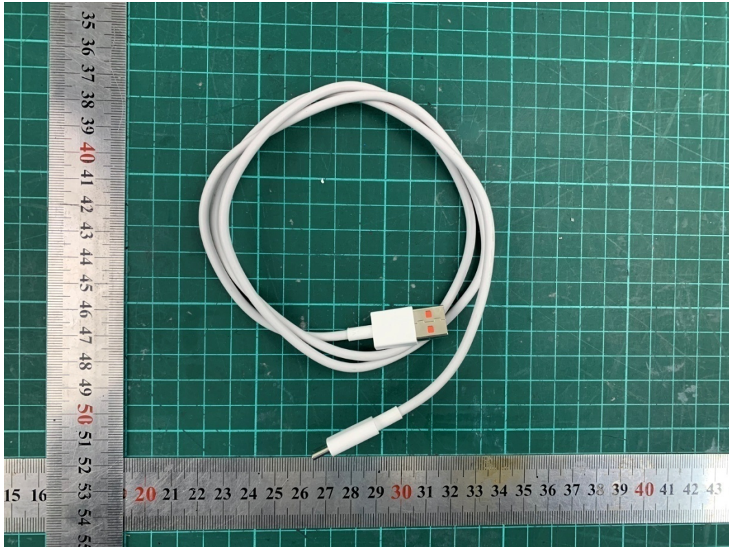
d: USB Cable