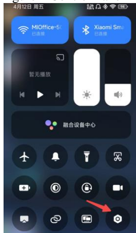
Figure 1 Control Panel