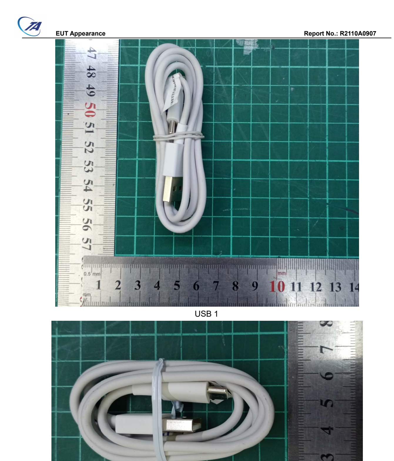
USB 2 d: USB Cable Picture 1: Constituents of EUT