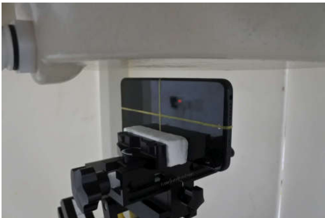
Left Side, Test Separation 10 mm