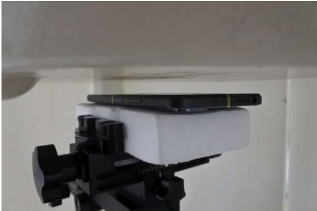
Front, Test Separation 10 mm