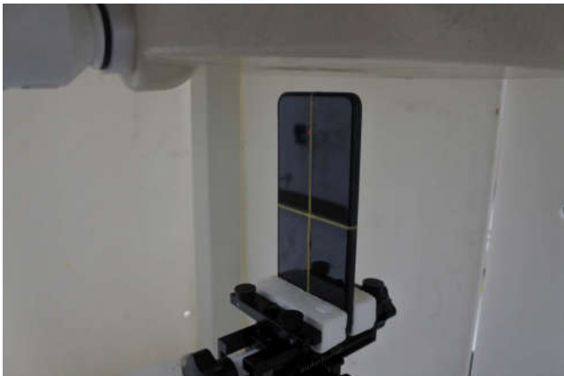
Top Side, Test Separation 10 mm