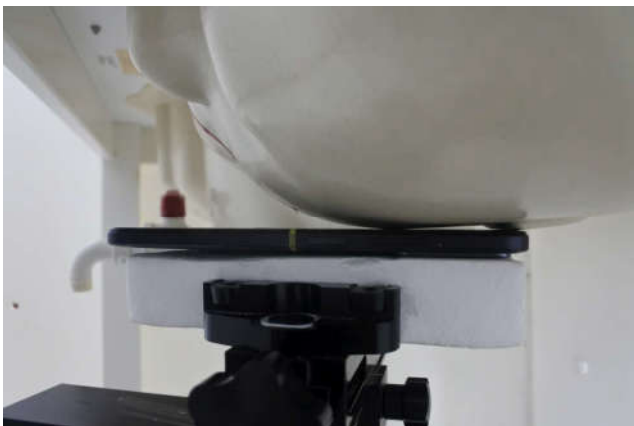
Left Cheek, Test Separation 0 mm