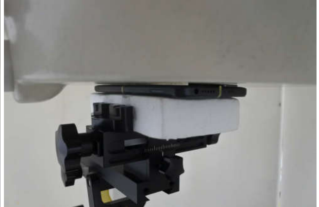
Back, Test Separation 0 mm