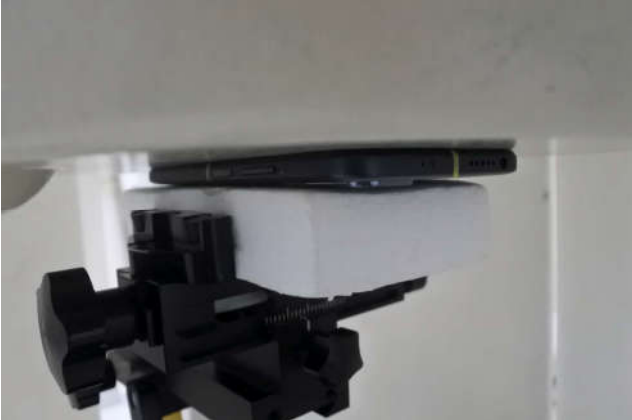
Front, Test Separation 0 mm