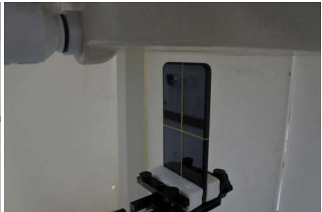
Bottom Side, Test Separation 10 mm