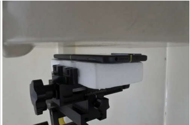
Back, Test Separation 10 mm