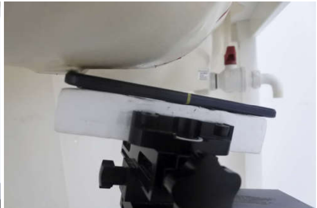
Right Tilted, Test Separation 0 mm