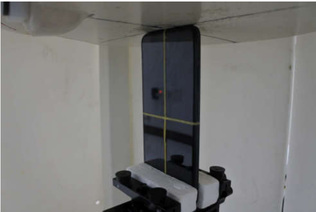
Top Side, Test Separation 0 mm