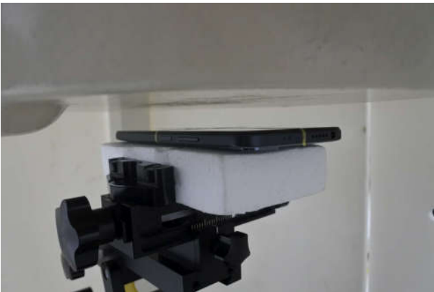
Front, Test Separation 15 mm