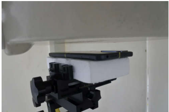
Back, Test Separation 15 mm