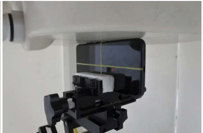
Right Side, Test Separation 0 mm