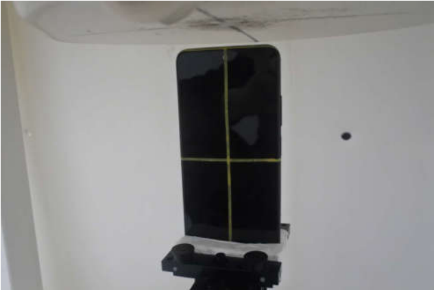
Top Side, Test Separation 15 mm(sensor off)