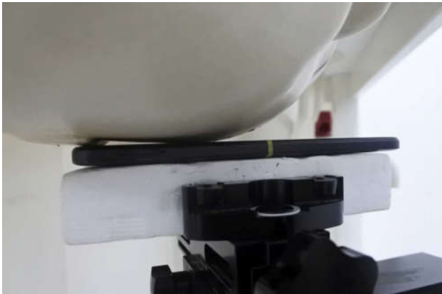
Right Cheek, Test Separation 0 mm