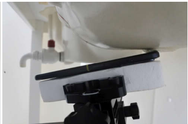
Left Tilted, Test Separation 0 mm