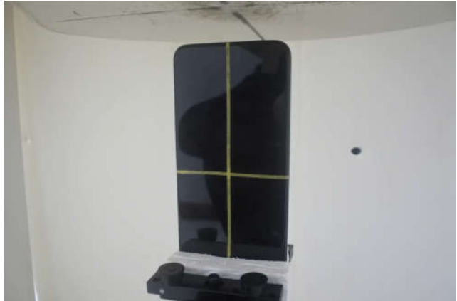
Bottom Side, Test Separation 19 mm(sensor off)