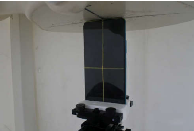
Top Side, Test Separation 0 mm