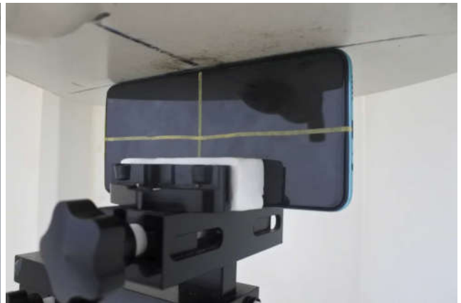
Right Side, Test Separation 0 mm