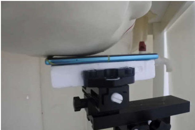
Right Cheek, Test Separation 0 mm