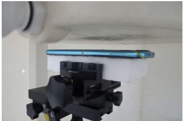
Back, Test Separation 15 mm