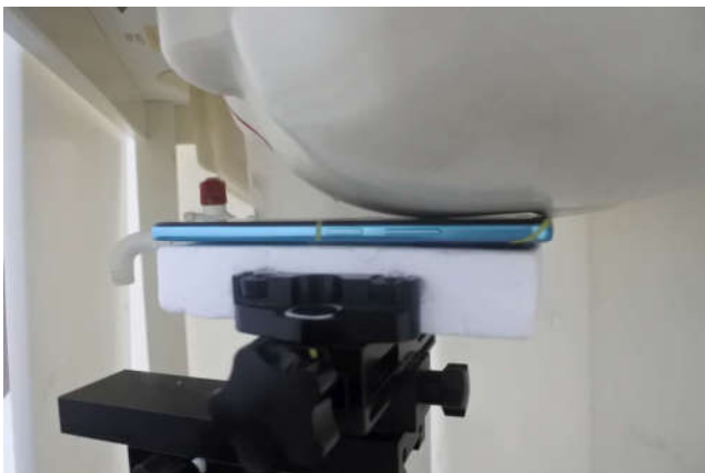
Left Cheek, Test Separation 0 mm