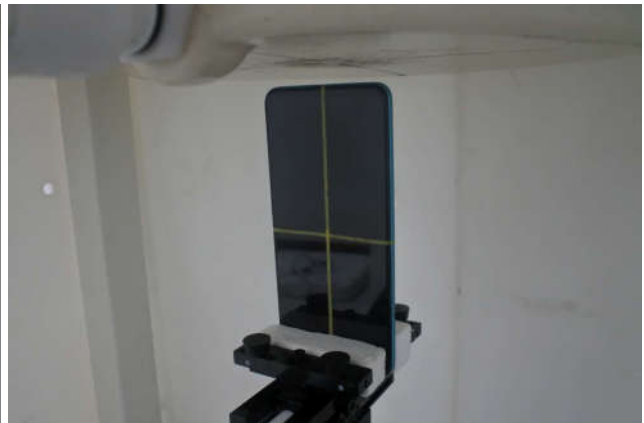
Bottom Side, Test Separation 10 mm