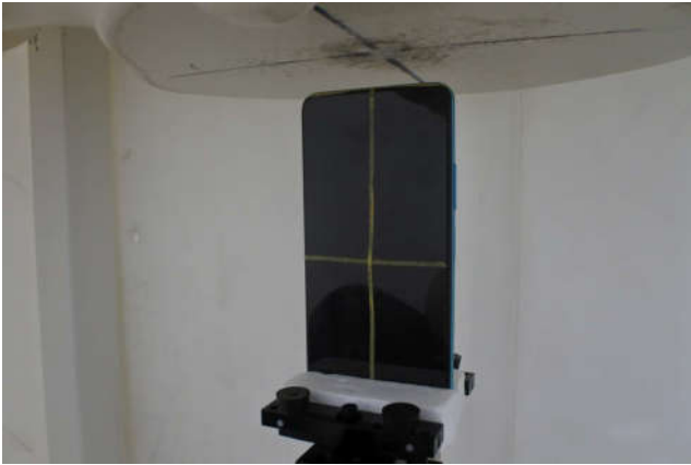
Top Side, Test Separation 15 mm(sensor off)