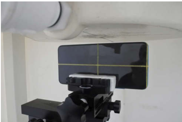
Left Side, Test Separation 10 mm