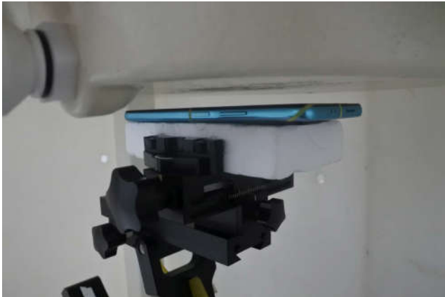
Front, Test Separation 10 mm