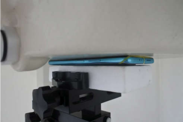
Front, Test Separation 0 mm