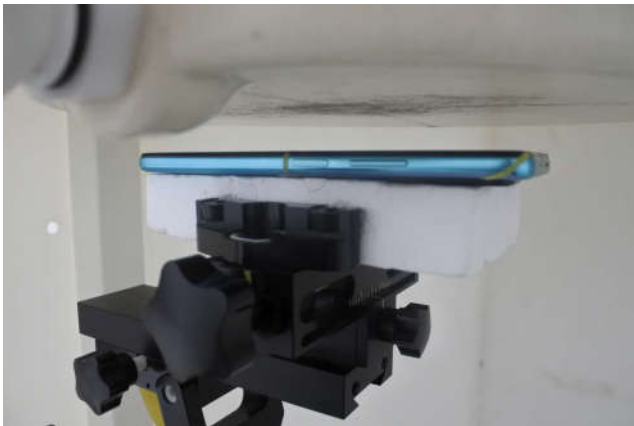
Front, Test Separation 15 mm