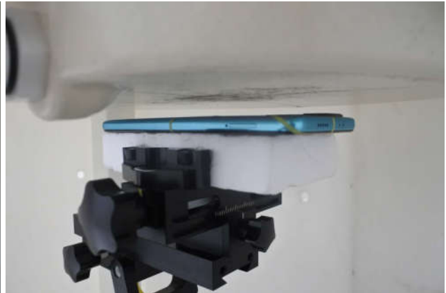
Back, Test Separation 10 mm