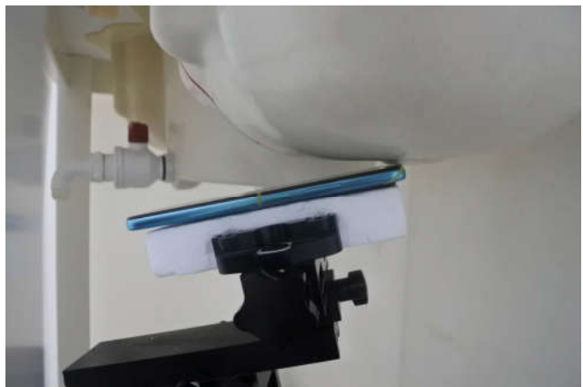
Left Tilted, Test Separation 0 mm