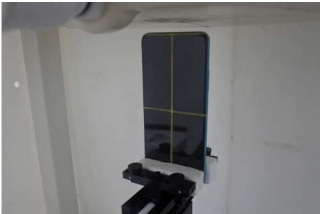
Top Side, Test Separation 10 mm