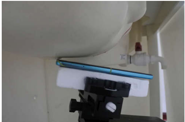
Right Tilted, Test Separation 0 mm