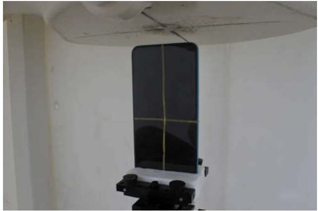
Bottom Side, Test Separation 15 mm(sensor off)