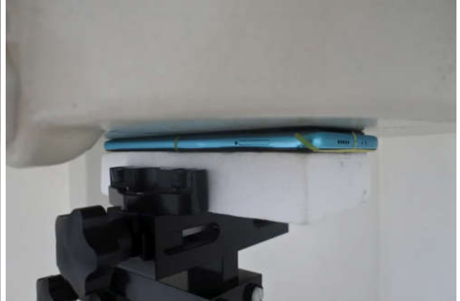
Back, Test Separation 0 mm