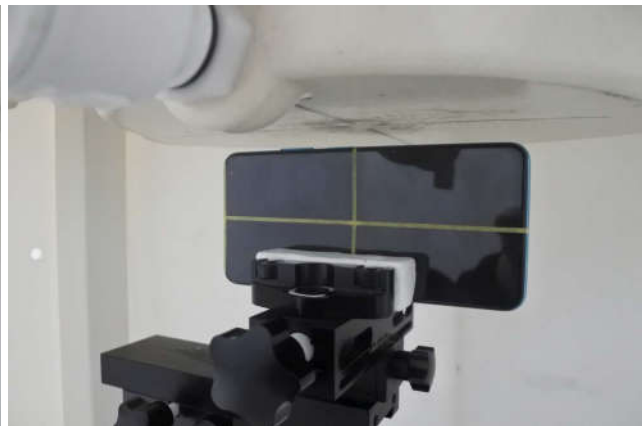
Right Side, Test Separation 10 mm