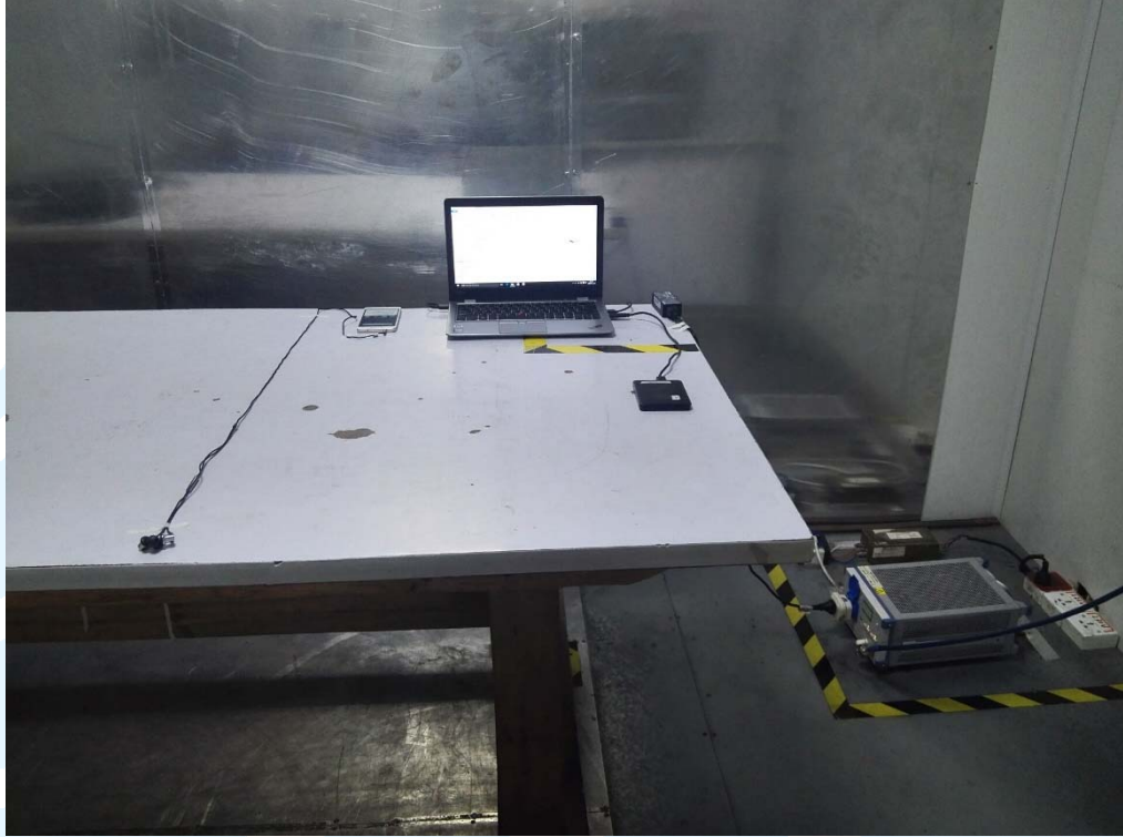
Conducted Emission_ Mode 3