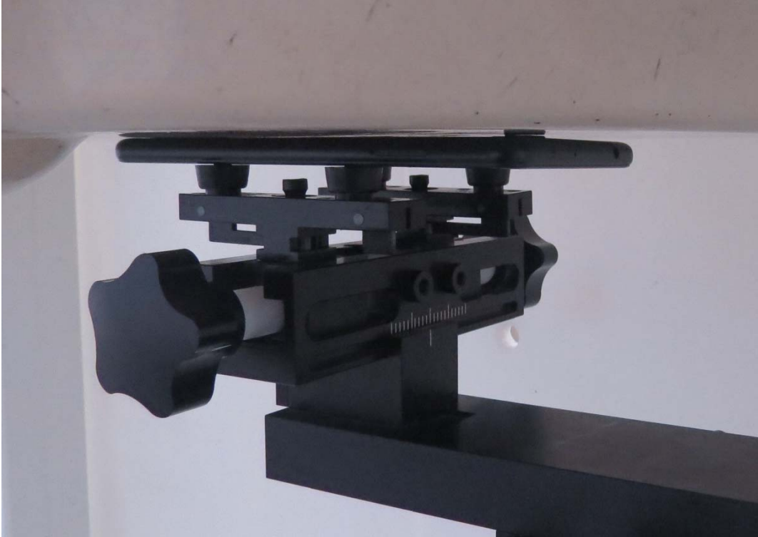
Picture 11: Back Side, the distance from handset to the bottom of the Phantom is 0mm