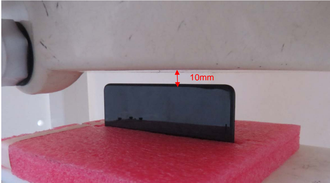
Picture 7: Left Side, the distance from handset to the bottom of the Phantom is 10mm