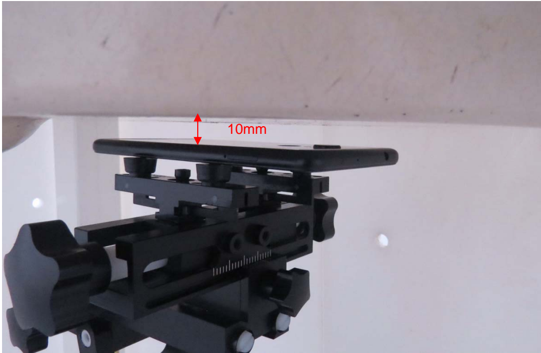
Picture 5: Back Side, the distance from handset to the bottom of the Phantom is 10mm