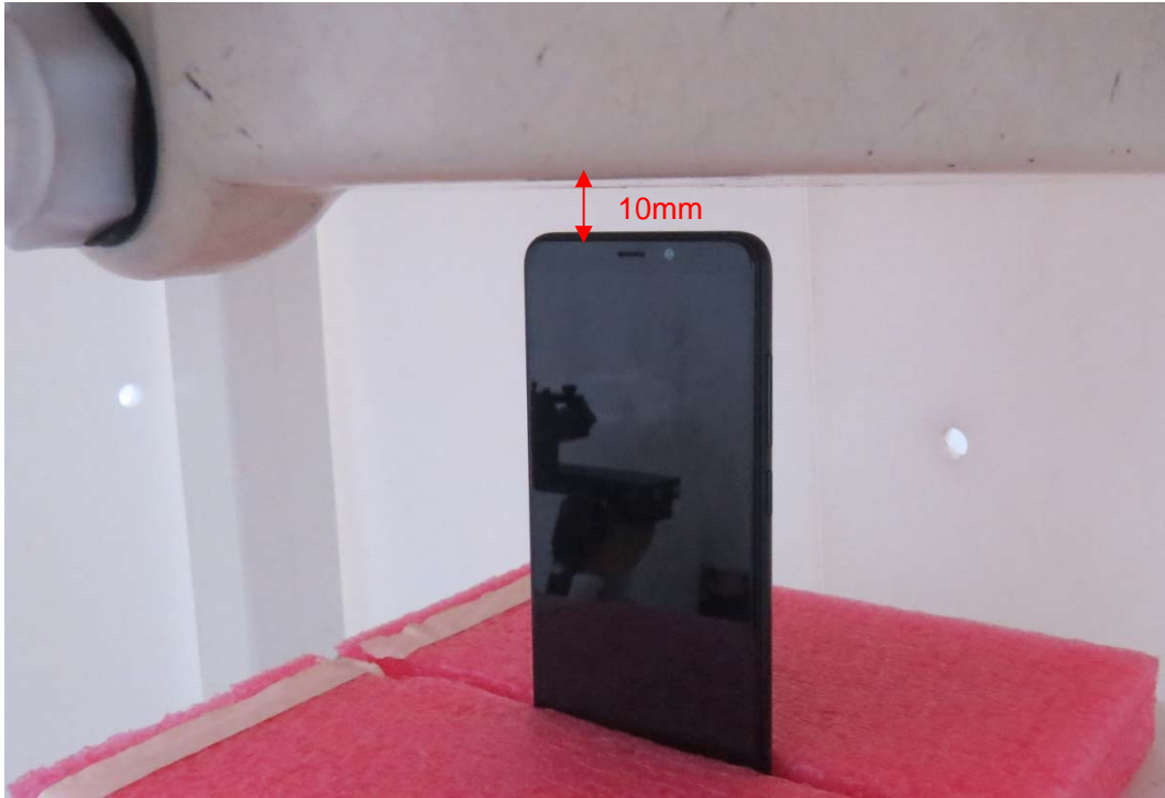
Picture 9: Top Side, the distance from handset to the bottom of the Phantom is 10mm