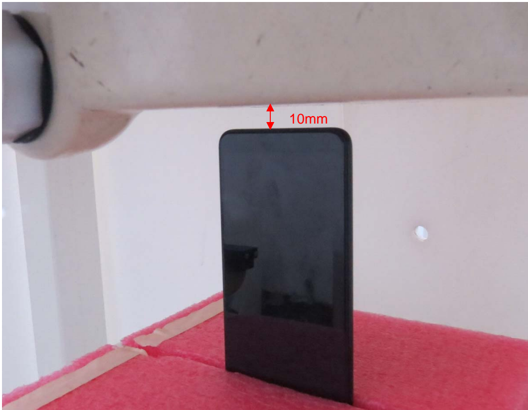
Picture 10: Bottom Side, the distance from handset to the bottom of the Phantom is 10mm