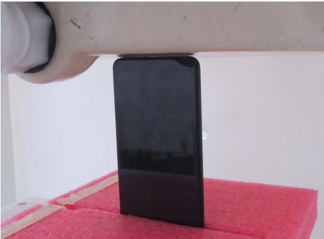
Picture 12: Bottom Side, the distance from handset to the bottom of the Phantom is 0mm