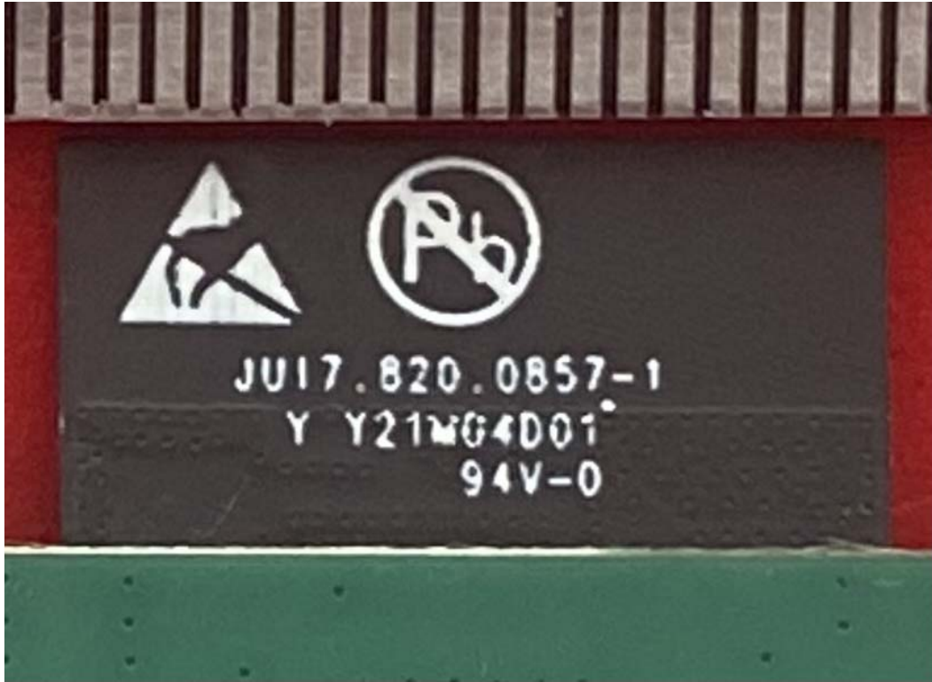
IC Details 3