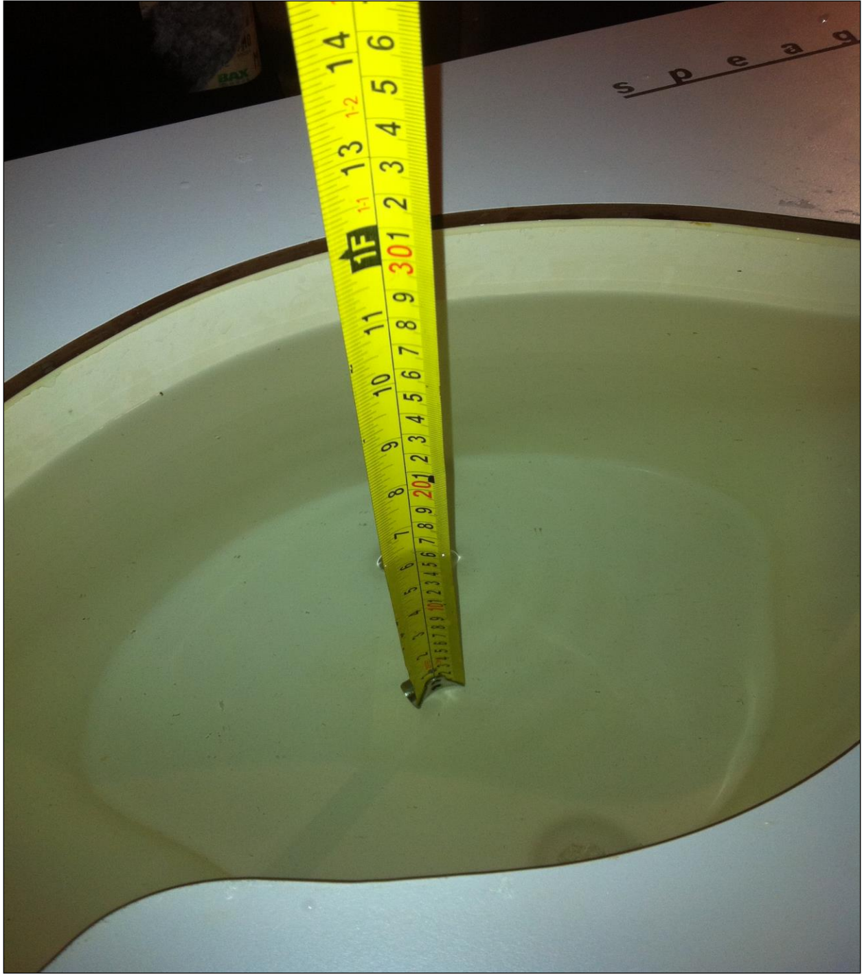
Photograph 3. Fluid Depth