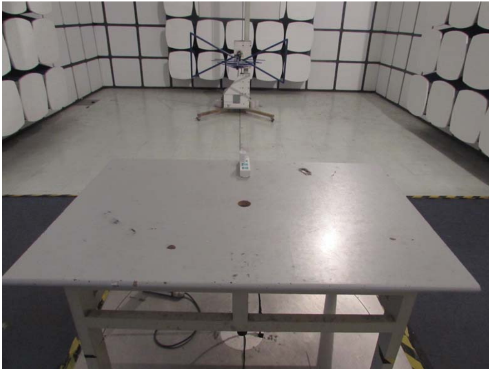
Radiated Test (1000-25000 MHz)