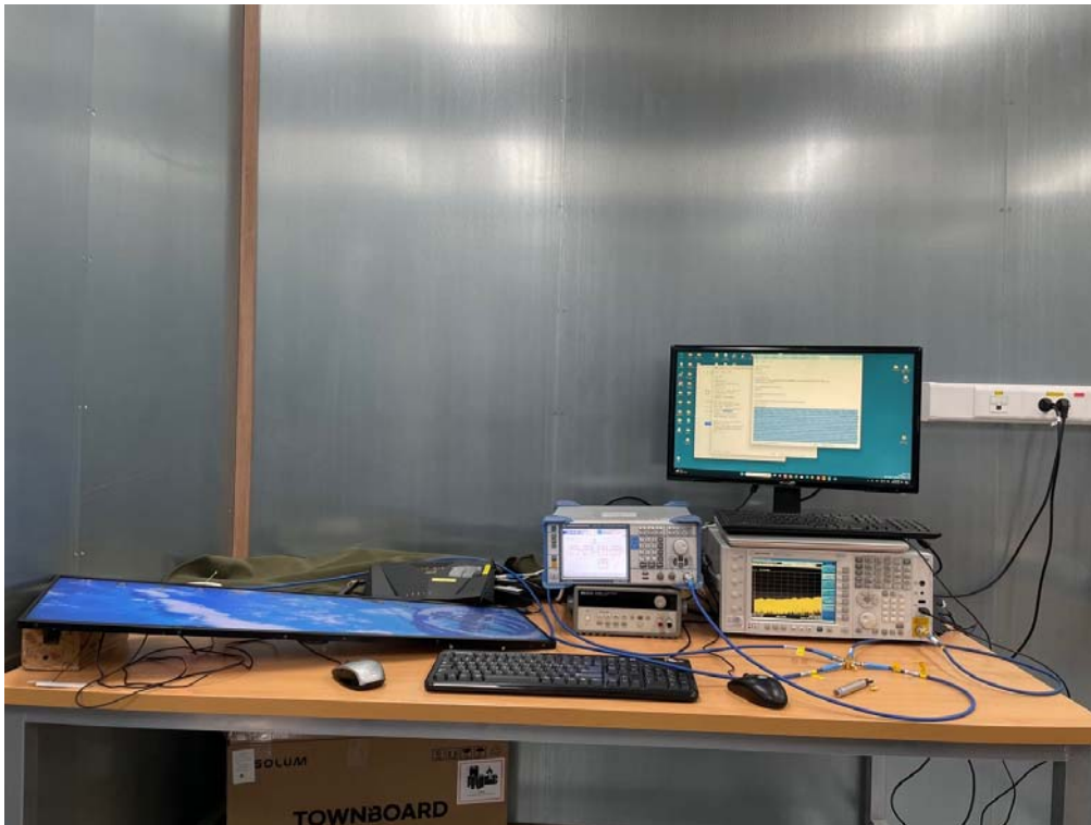
AC Power Line Conducted Emissions