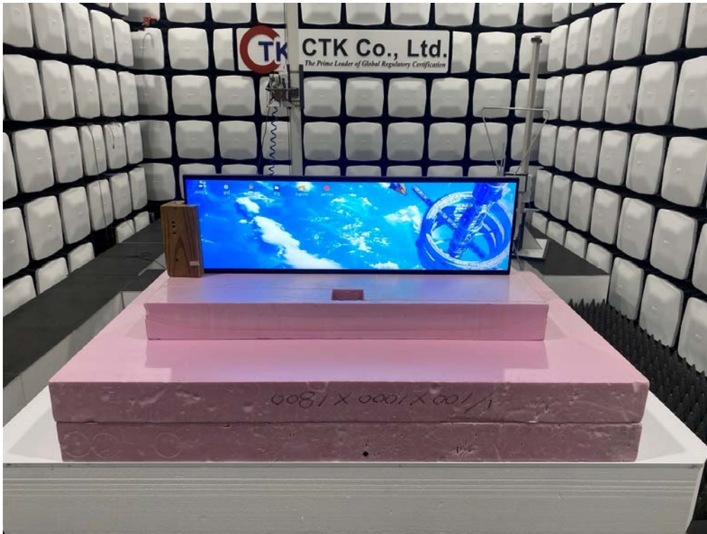
18 GHz to 26.5 GHz