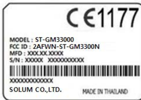
Product Label (Back, 35 X 25mm)