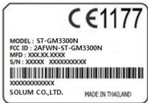
Product Label (Back, 35 X 25mm)