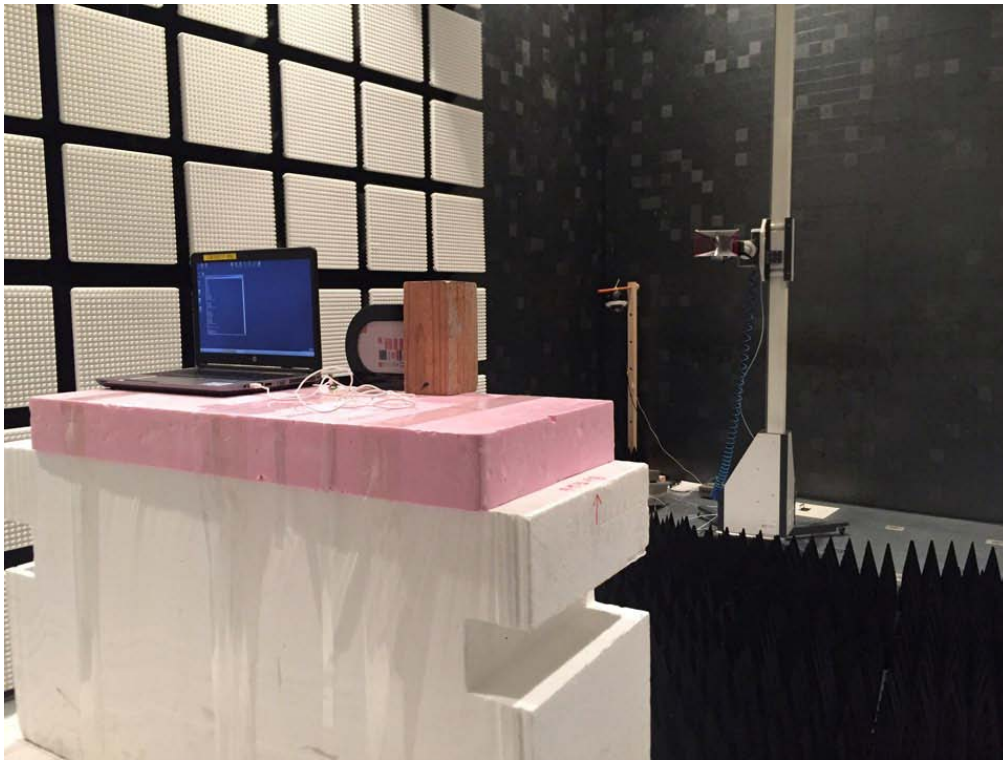
18 GHz to 26.5 GHz