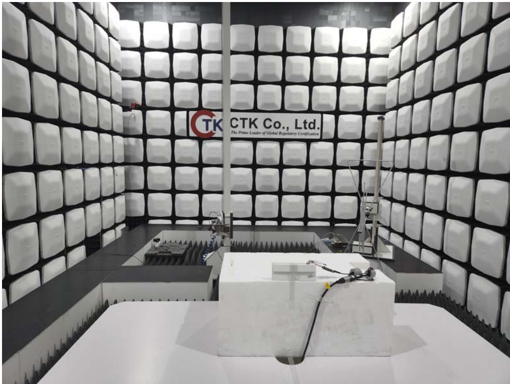
18 GHz to 26.5 GHz